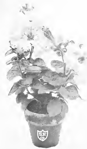
3-inch pot Pride of Portland Petunia showing quality.

A new selection, resembling a giant of California, large ruffled edges, soft heliotrope with network of darker veins radiating from dark colored throat.